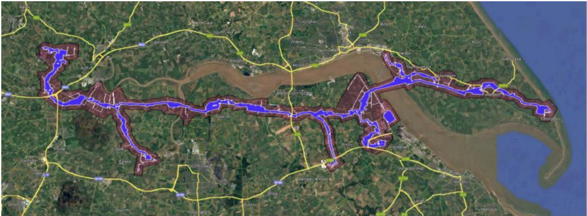
Figure 5-1 – 500m Core Consultation Zone