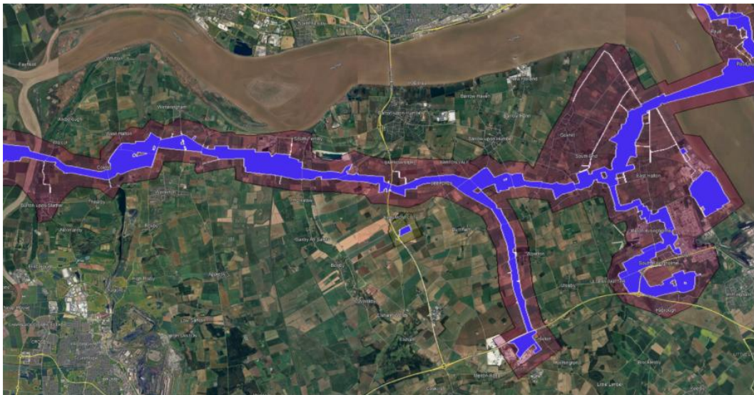
Figure 5-3 – 500m Core Consultation Zone (River Trent to the Northern Bank of the Humber Estuary)