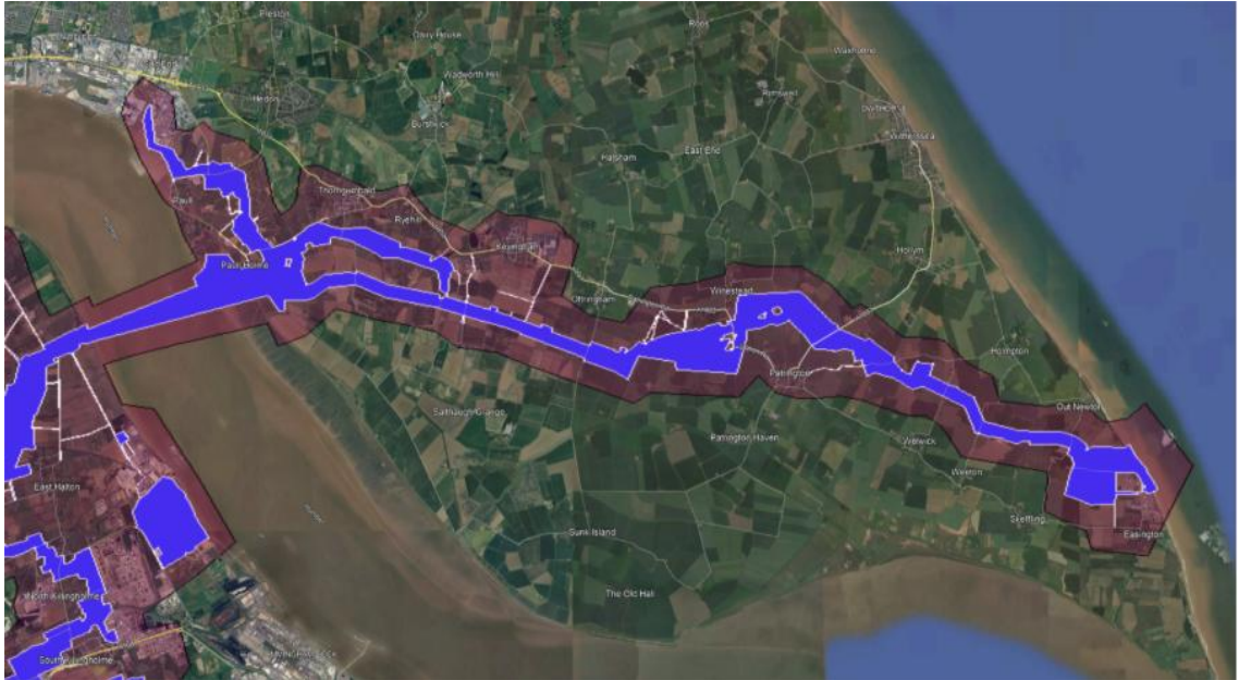
Figure 5-4 – 500m Core Consultation Zone (Northern Bank of the Humber Estuary to the Coast North of Easington)