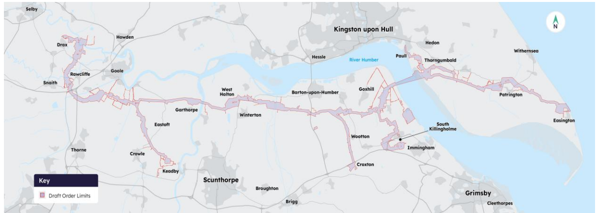
Figure 1-1 – Project Location

1.1.6 Figure 1.1. provides an overview of the project location.